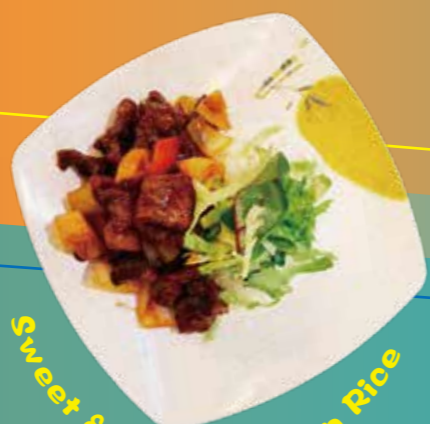
Sweet & Sour Beef On Rice