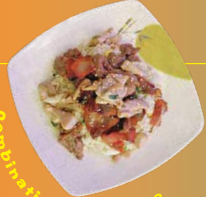
Combination Fried Rice