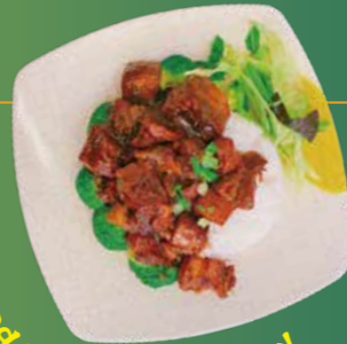
Five Spiced Braised Pork Belly